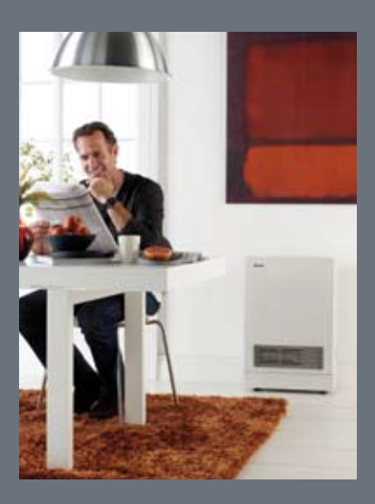
Energysaver® Flued Gas Space Heating