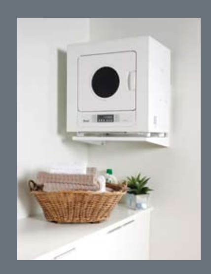
Gas Clothes Dryei