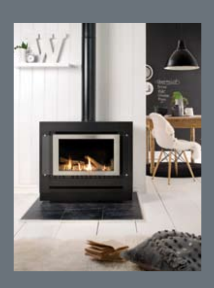
Sapphire Gas Log Flame Fire